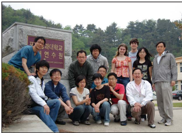
The lab group at the POSTECH Training Institute.