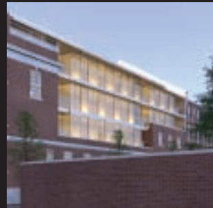
Urbanica's most high-profile project, YooD4.