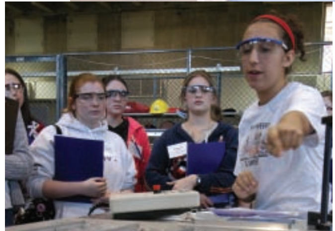
(Top to bottom) LEGO Robotics summer camps, Exploring Engineering Day, Black Family Technology Awareness Day, and Design Your Future Day are part of Rensselaer’s effort to interest young people in pursuing occupations in the fields of science and engineering.